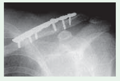
Fig 2 An intra-operative x-ray following open reduction and internal fixation with a small fragment LC-DCP. Note that the soft-tissue attachment to the comminuted fragment(s) has been left intact, and these pieces positioned under the plate without excessive stripping. If possible, a lag screw can be placed through the plate into this fragment.

Fig 3 Final x-ray revealing solid union.